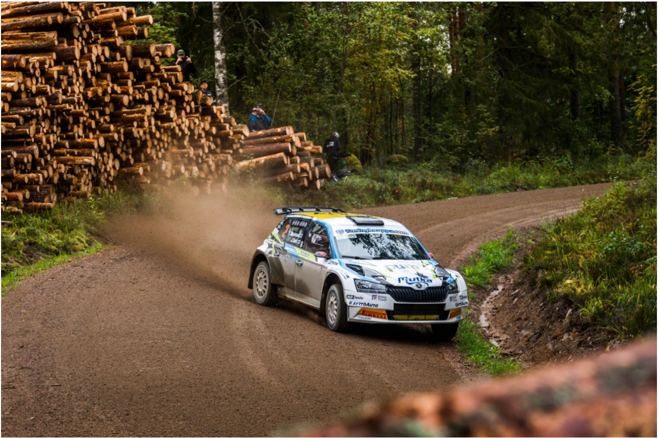
Taneli Niinimäki / AKK