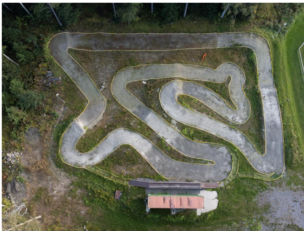
1/8 track layout

The track is closed from Friday 4th of August to Thursday 10 th of August.