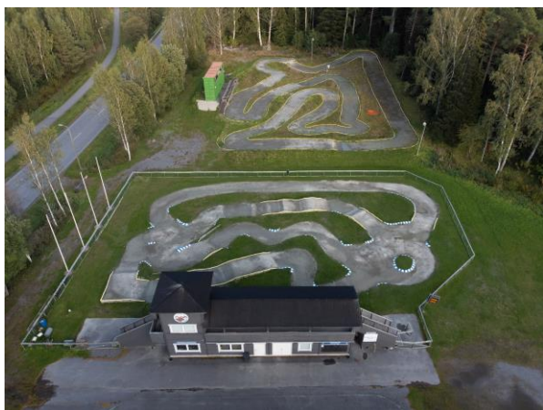
1/10 track in front, 1/8 track in rear

The track length is about 320 meters. The main straight is 5 meters in width and other sections 4 meters wide. Track surface is clay.