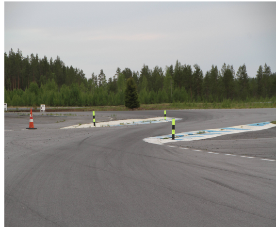
Point 6 chicane